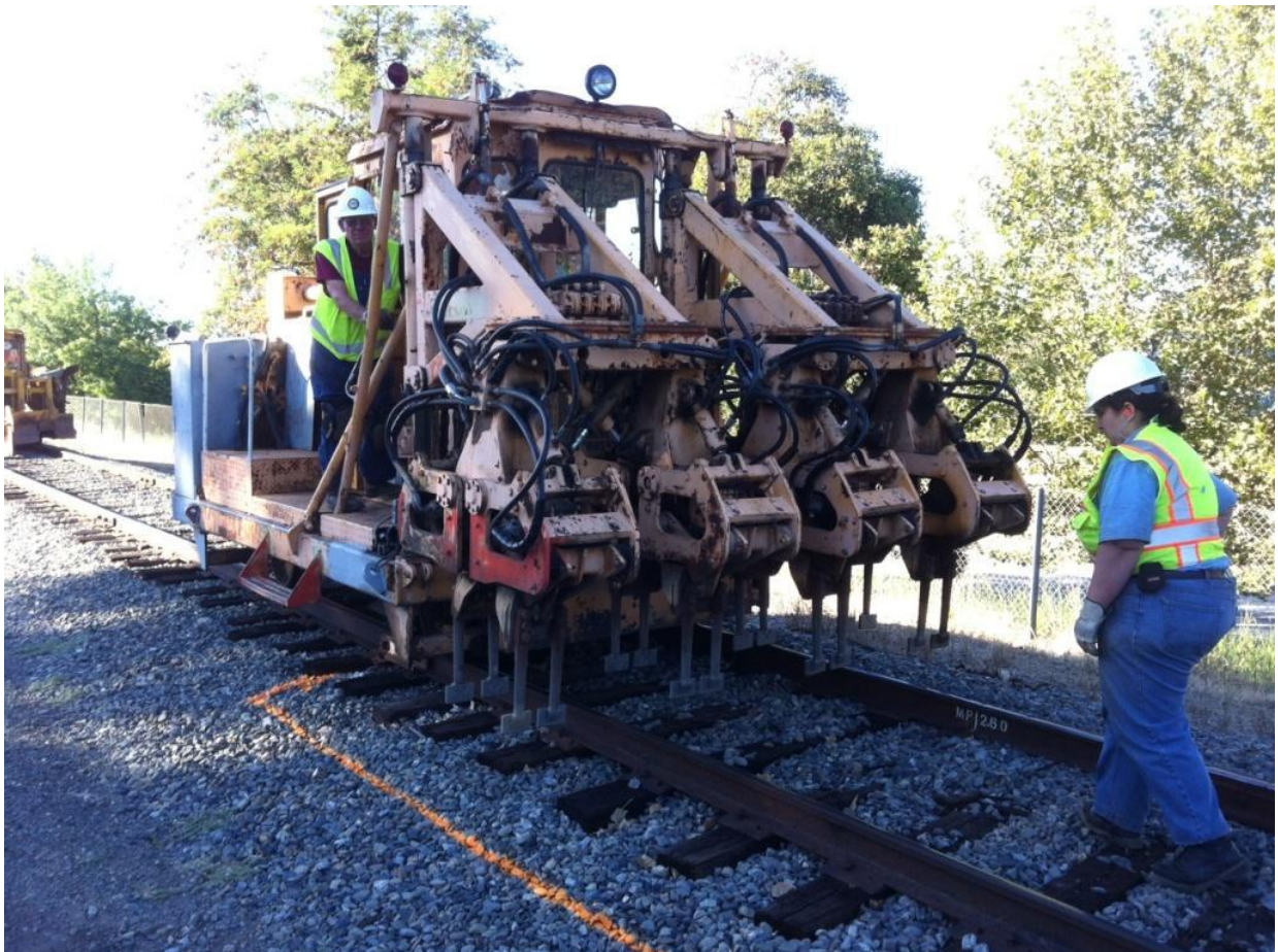
Cliff and Heather guiding the tamper in correcting a narrow spot discovered by your trusty track inspectors.