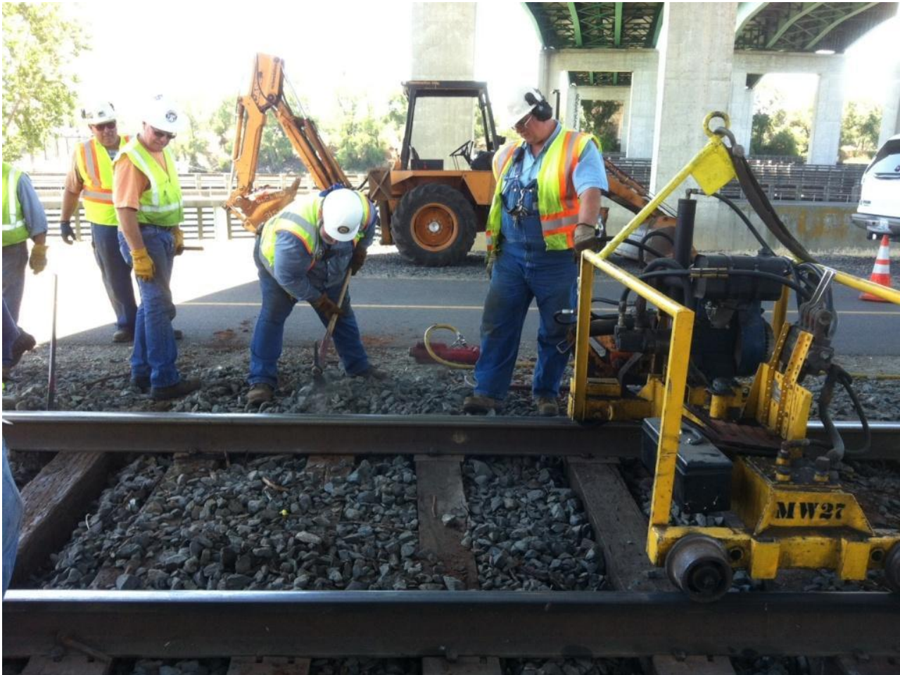
It took a team effort to coordinate the removal of ties and equipment while under traffic.