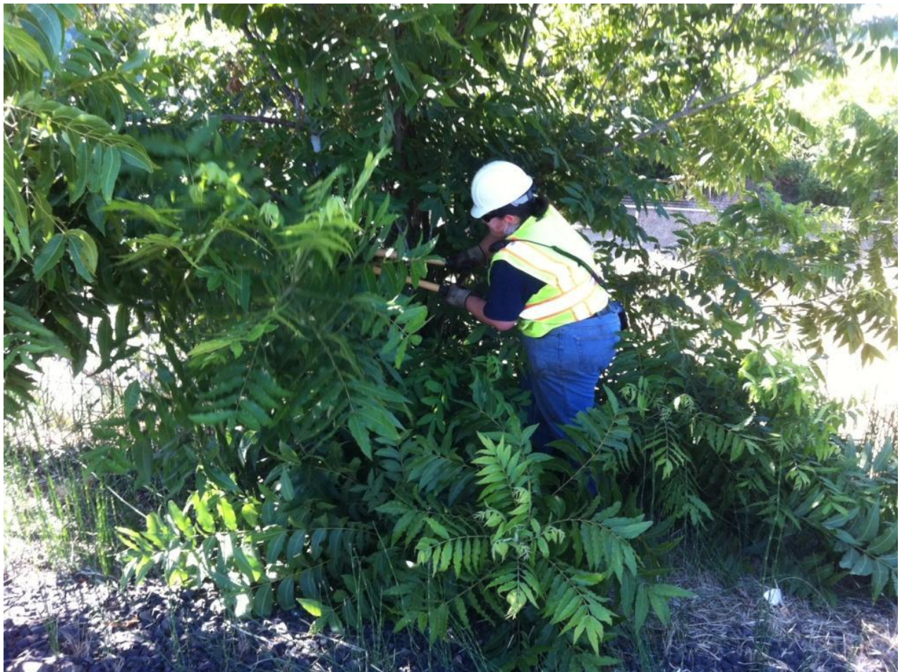
Heather at war!