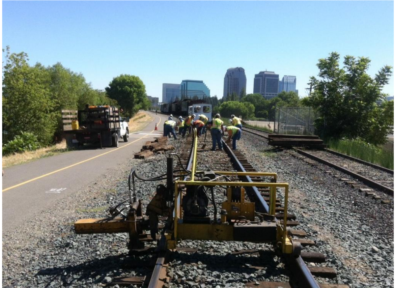
Your MOW Team focused on the task at hand!